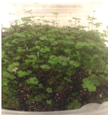
Spores applied by mixing in water and pouring on mix; "spore soup"