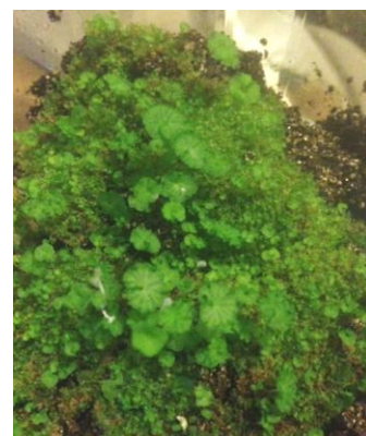
Spores sprinkled onto mix; sporophytes were more crowded and did not grow as quickly or as large as those using the "spore soup"